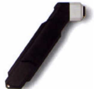
DATA TRANSFER UNIT

After the rounds are finished, supervisory personnel issue the proper commands to the DAU and place it in the DATA TRANSFER UNIT (DTU) . The DTU is used to transfer the Tour Data from the DAU to a PARALLEL PRINTER.